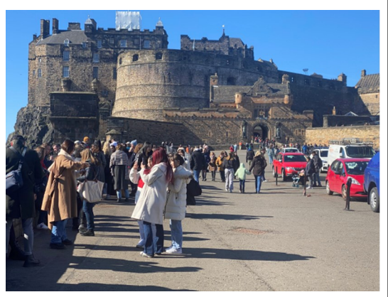
Our team at Edinburgh Castle.

On this missions trip the precious couple to the left celebrated their 50th Wedding Anniversary, while the lovely newlyweds below celebrated their Honeymoon! Wow!