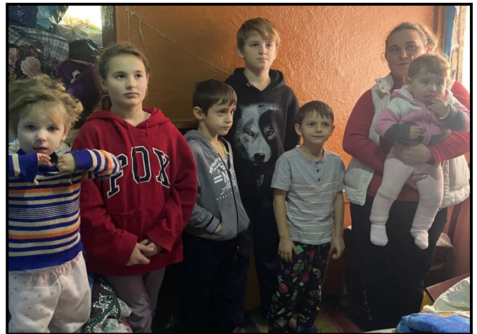
We were able to help these 6 children who fled from the Ukraine. Thank You!

Just two days ago, as we dressed to go to church in Odessa, the pastor texted us to make sure that we knew that the air raid sirens were sounding, and to let us know that Russian aircraft had been spotted flying over the region. He told us too, that they would still be gathering for the morning service if we still wanted to come. He said he would understand if we didn't. How glad we were that morning to be in church with them! This gentle, reserved pastor preached powerfully from Romans 8, assuring his hurting people that NOTHING could separate them from the love of God; not life or death or any other thing! How the Word came alive as he preached it in its rawest form to his congregation, who daily, are staring that very possibility in the face. How privileged we were to be with them and to help by giving them the funds that many of you have sent to us on their behalf.