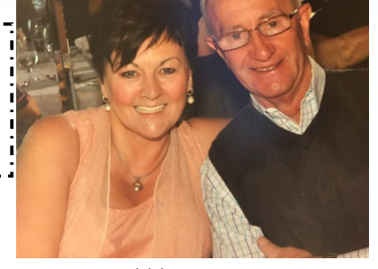
We would love come to your church to share the story of Adullam House! Call our office for more information.

Don't forget! Adullam House can always use paper products of all kinds. Visit adullamhouse.org/supplies for a list of needed items.