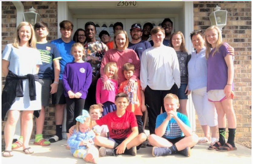
The first group to visit our new retreat! History in the making!

are taking place in this 25th anniversary year! The original (and mostly unknown) legal name under which Adullam House came into being, New Convictions Outreach , reflected the prison ministry that gave birth to the present work. That name has recently been changed to reflect the expansion of the work. Adullam International Ministries (AIM) is now the umbrella under which Adullam House, here in the USA, will continue its great work rescuing children at-risk. However, that name also reflects the fact that AIM is also reaching and caring for children overseas, in Moldova and Africa. These children are in desperate need of our help. How exciting to think that some of the young people we have raised here at Adullam House may now be used by God to minister to other kids overseas! We plan to celebrate our 25th anniversary year with an open day on September 8th