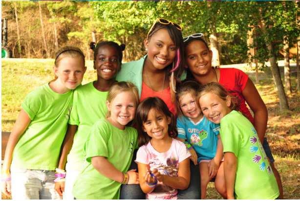
Some of our little girls got to meet Jamie Grace and even autographed our Adullam House CD for her!!!